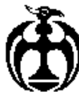
Water Bird—Symbol of Renewal